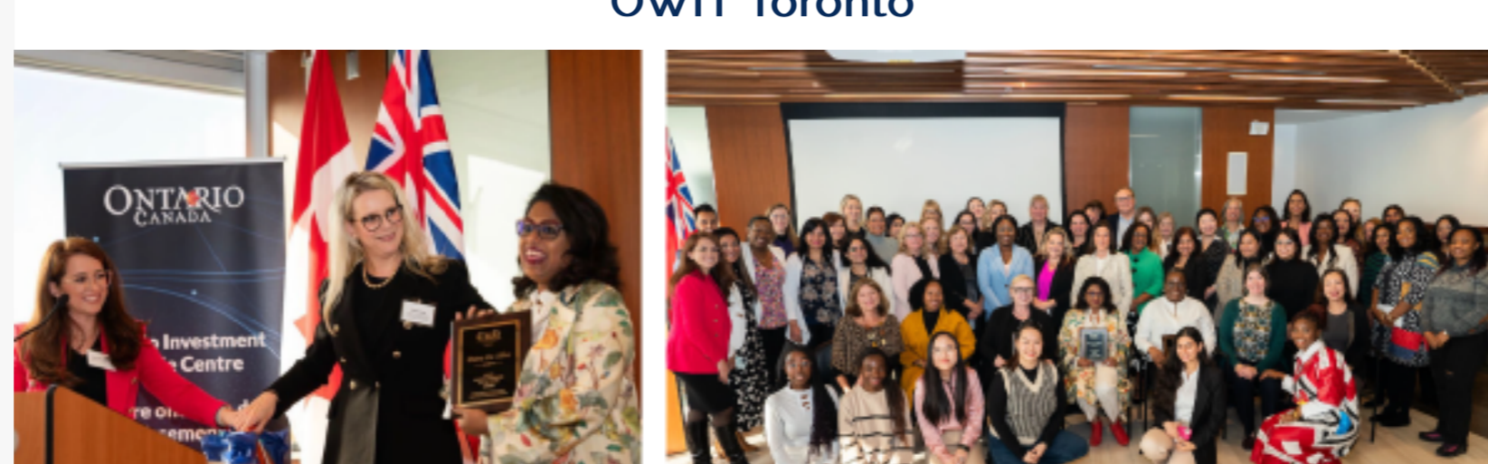
Organization of Women in International Trade - Toronto's 2023 Export Awards. A fantastic event celebrating the achievements of remarkable women in international trade!