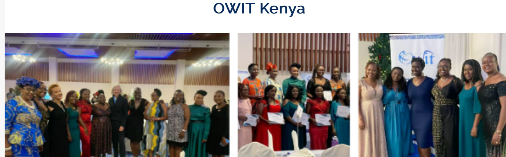
OWIT Kenya Gala Awards on 30th November 2023.